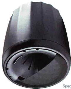
Speaker comes with full grille